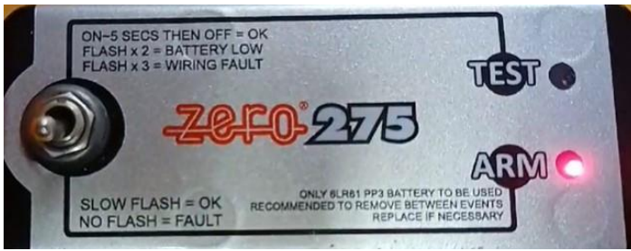
System armed – ready to be used