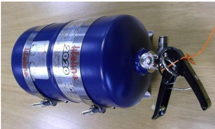
System with safety pin - not ready to be used